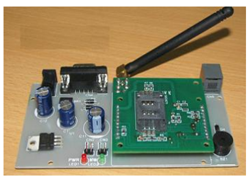
Fig.2.1 GSM Module

The GSM module uses SIM technology to exchange data, and signaling between the user and the utility. The GSM module acts as the communication link between the prepaid unit and the server at the utility. The GSM module will transmit the consumption amount to the server.